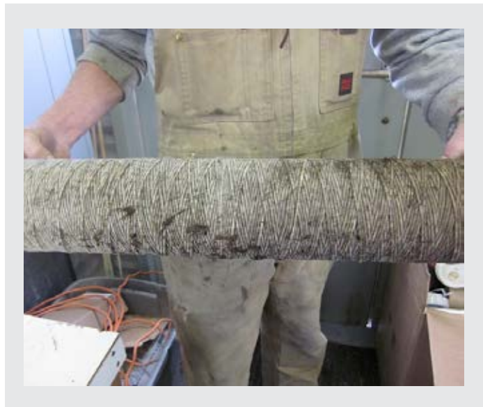
An operator displays a used filter. Filtration is a relatively recent addition to this small town's water supply.

i. Communication between Operators and Decision makers: The complex nature of any water system can make it difficult for operators to explain the system to non-operators (i.e. decision-makers), including where risks exist, the types of solutions that are available that will work within a specific water system. The DWSP provides a tool to highlight issues and their solutions in a way that is easy to understand. Operators who did not