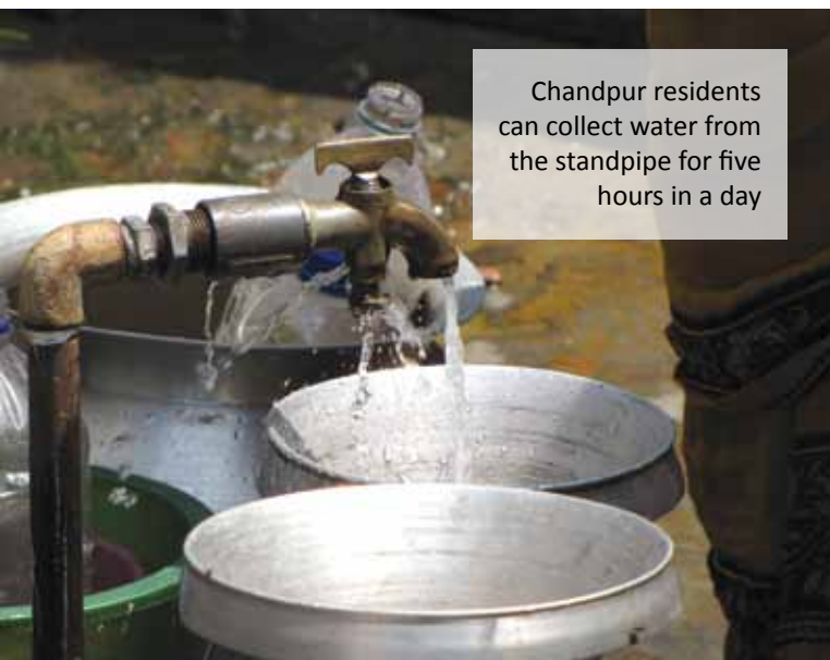
Chandpur residents can collect water from the standpipe for five hours in a day