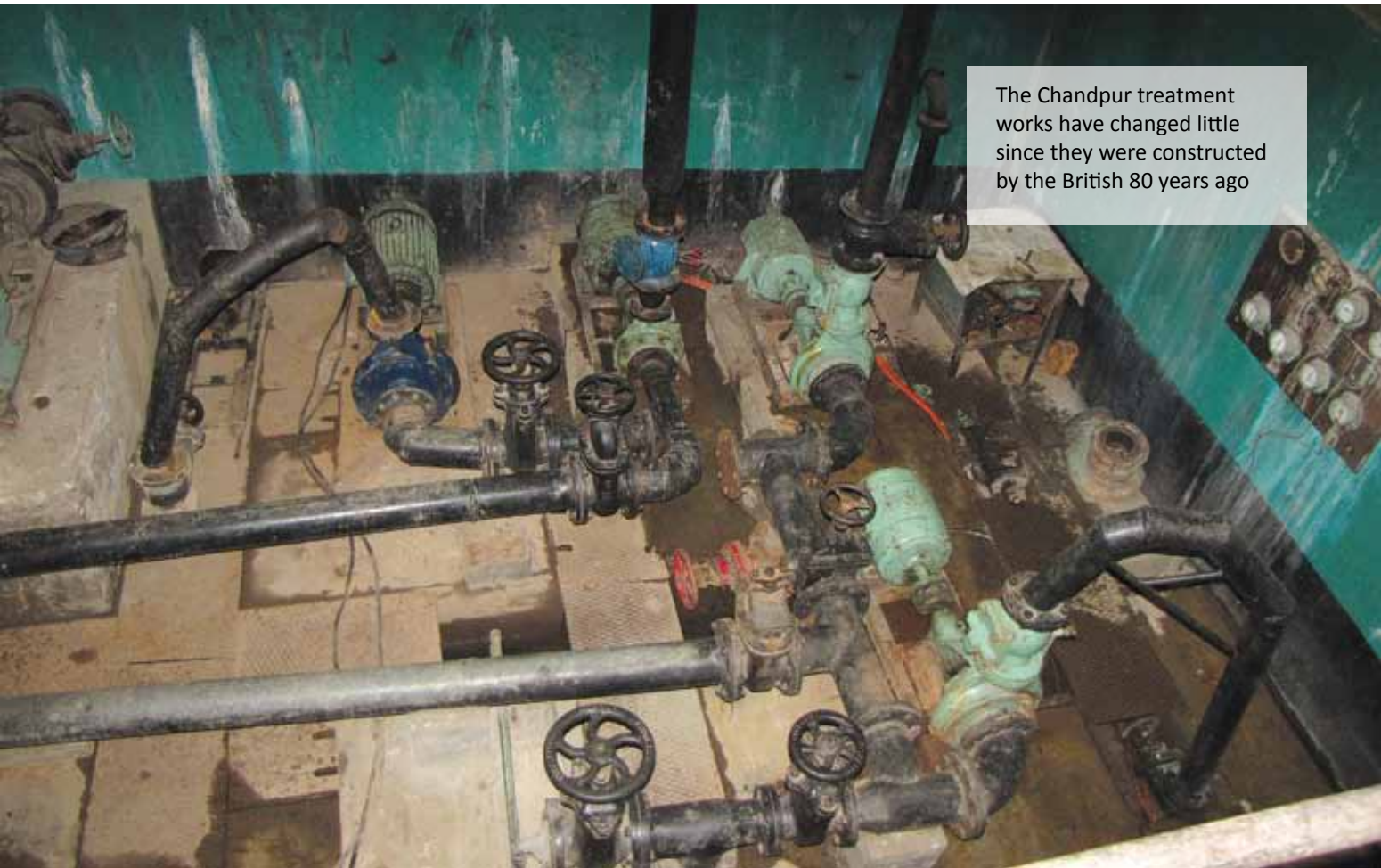
The Chandpur treatment works have changed little since they were constructed by the British 80 years ago