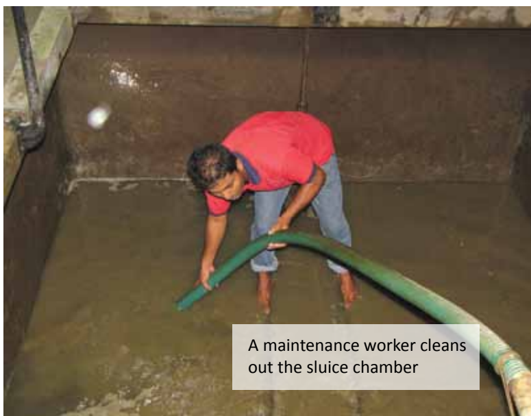
A maintenance worker cleans out the sluice chamber