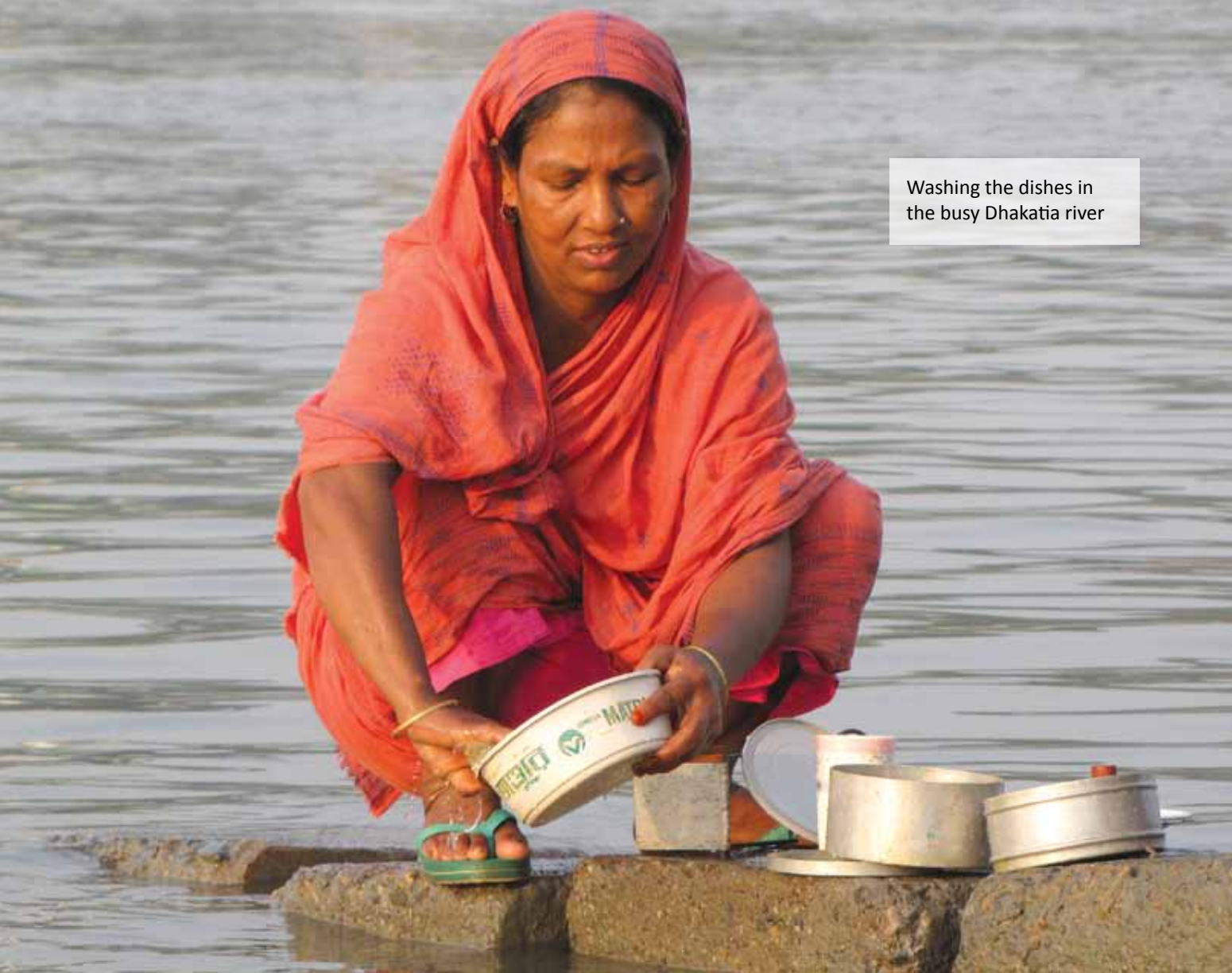
Washing the dishes in the busy Dhakatia river